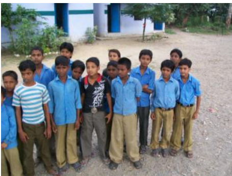
Class 5 boys of the school.

Last Friday, the 25 th of September, a batch of six students from both IB 1 and 2 paid a casual visit to a nearby Government School. Their aim was to observe and identify the problems in order to help improve the school. There was some shocking information which came to light, such as the fact that out of approximately 450 students only an estimated 220 were present on the day of our visit. The IB students were also told that some parents only admitted their students in the school to obtain a 600 rupees cheque the government provided to each student as a scholarship. After the family would receive the money, they would pull out their children. What we also learnt was that often stu-