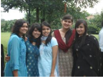
The girls dressed up as particular teachers.

“Just for the teachers, to give them a surprise, we arranged a play..”