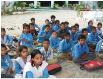
The students sitting outside, learning math.

Last Friday, the 25 th of September, a batch of six students from both IB 1 and 2 paid a casual visit to a nearby Government School. Their aim was to observe and identify the problems in order to help improve the school. There was some shocking information which came to light, such as the fact that out of approximately 450 students only an estimated 220 were present on the day of our visit. The IB students were also told that some parents only admitted their students in the school to obtain a 600 rupees cheque the government provided to each student as a scholarship. After the family would receive the money, they would pull out their children. What we also learnt was that often stu-