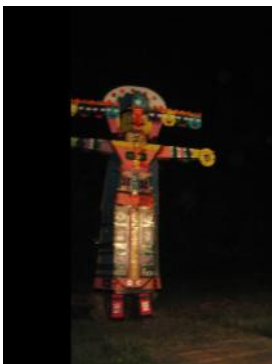
The statue of Ravan.