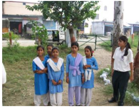
Getting to know the girls better.

dents were absent due to jobs they had, for example one student washed dishes at a hotel. The IB students conversed with teachers as well as with the younger students. Some outstanding reports were in fact that most of the students present were well motivated to come to school and many even carried aspirations for the future.