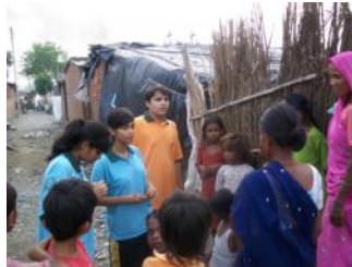
Informing the parents about our 'school'.

people's necessities, and water would only be supplied at 6 a.m. to 7 a.m. There was a shortage of electricity, as electricity would only be supplied for five hours out of twenty-four hours. When we asked them about their children, they told us that their children loitered around the whole village and never went to school as their parents never had sufficient funds to send them to school. They said that there were only ten to twelve children who went to school. We then told them about the new school we would be starting; they were excited at first but were reluctant after a while. We also ensured the child's safety as one of the group members would pick up and drop the child on Satur-