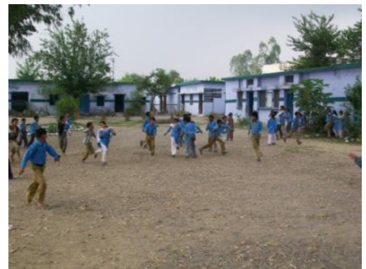
Playing games with the children on the second visit.