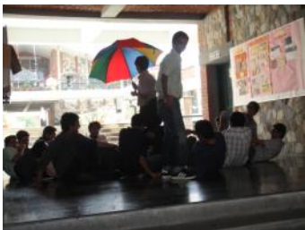
The play performance

“Just for the teachers, to give them a surprise, we arranged a play..”